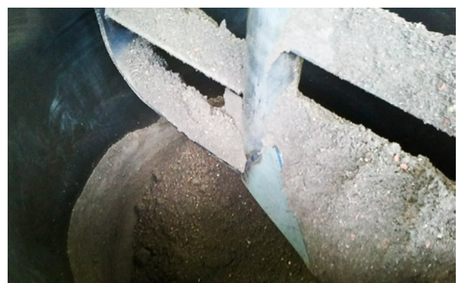
Sight into the batch reactor

Nitrogen gas is used as an inert medium inside the reactor. Control of the unit is realized through the PLC board, where all the operational parameters are shown (temperature, pressure, stirrer rotation speed, magnetron output, cooling water flow rate etc.)