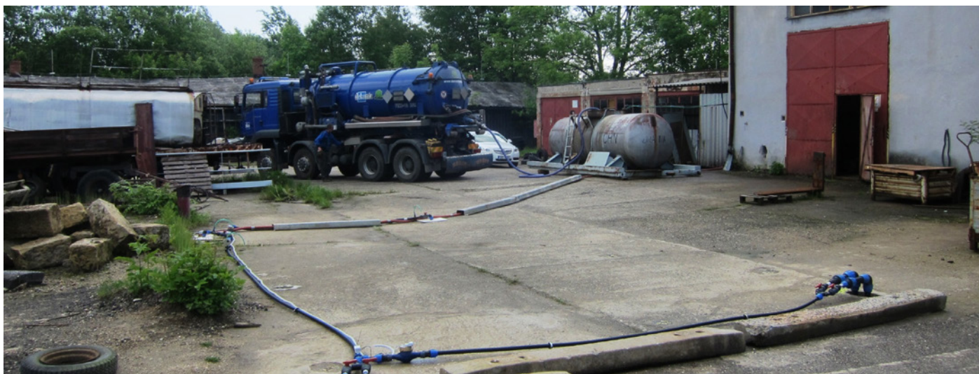
Organic substrate infiltration

DEKONTA, a.s. Dretovice 109, 273 42 Stehelceves Czech Republic