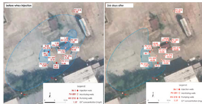
Kortan site - Cr(VI) concentrations in groundwater before and after substrate application