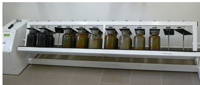
Laboratory batch test of bio-reduction potential

After 10 months of remediation the levels of Cr(VI) and Cr(total) concentration in groundwater dropped below the detection limit (<0.05 mg/l).